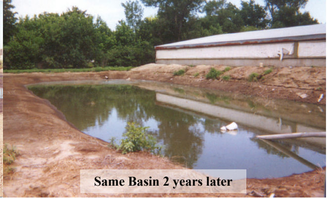
Same Basin 2 years later